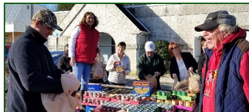
Thanksgiving Turkey Meals Partnered with Worcester County Bar Association & Worcester County Department of Social Services Provided Thanksgiving Turkey Meals for 265 Families