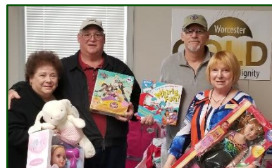
Helping Hands for the Holidays With community support, provided holiday gifts for 724 children and 68 vulnerable adults.