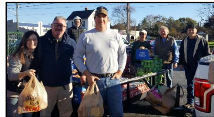
Thanksgiving Turkey Meals Partnered with Worcester County Bar Association & Worcester County Department of Social Services Provided 265 Thanksgiving Turkey Meals