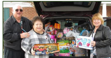
Helping Hands for the Holidays With community support, provided holiday gifts for 801 children and 68 vulnerable adults.