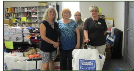
School Supplies for Students 492 Children Served

In 2017, Worcester County GOLD, Inc. provided vital support for 2,103 adults and 1,696 children, a total of 3,799 Worcester County citizens served.